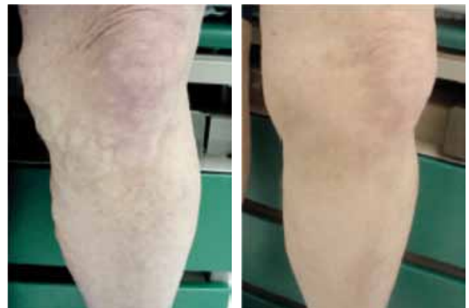
Before Endovenous Laser Treatment After Endovenous Laser Treatment

Immediate walking is encouraged to promote healing. Little to no pain is typically experienced, but may be treated with over-the-counter pain relievers as needed.